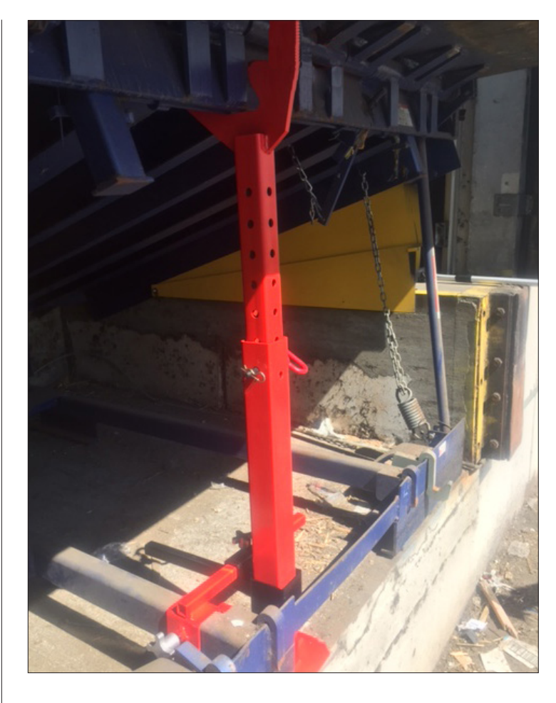
Shown on a CentraAir Series dock leveler, the Tough Strut will help provide safety at the loading dock by adding another means for additional support to air or mechanical levelers during maintenance.

Once the leveler is raised and the leveler's props are in place, secure the Tough Strut to the leveler's frame and adjust the height and positioning to maintain a secure placement on the leveler. Then if there's ever a fault with the leveler's props, the Tough Strut will be there to help prevent the leveler and it's lip from falling or being forced down.